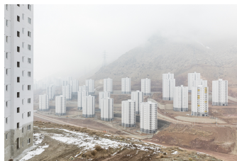
Iran, Pardis City - Phase 11